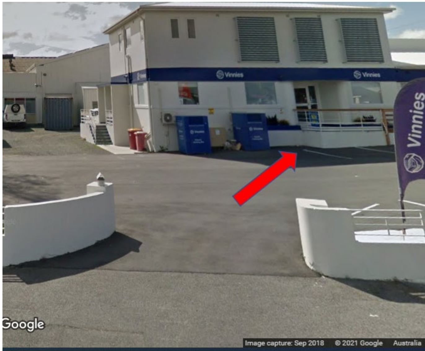
Image: Entrance into clinic operating out of the Vinnies building on Invermay Road

When you arrive at the Mowbray clinic, you will be greeted by staff and shown where to enter the building.