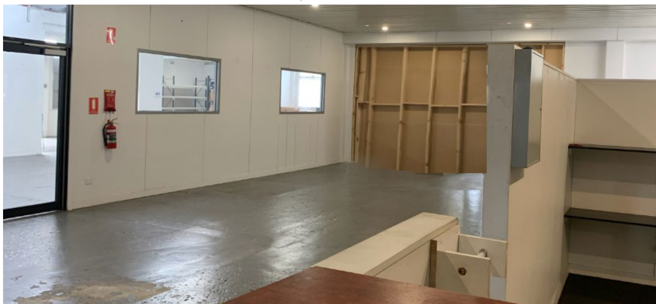
Image: Entry area in the clinic