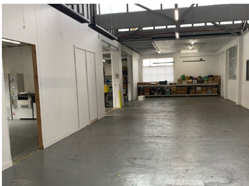
Image: Area where booths will be set up