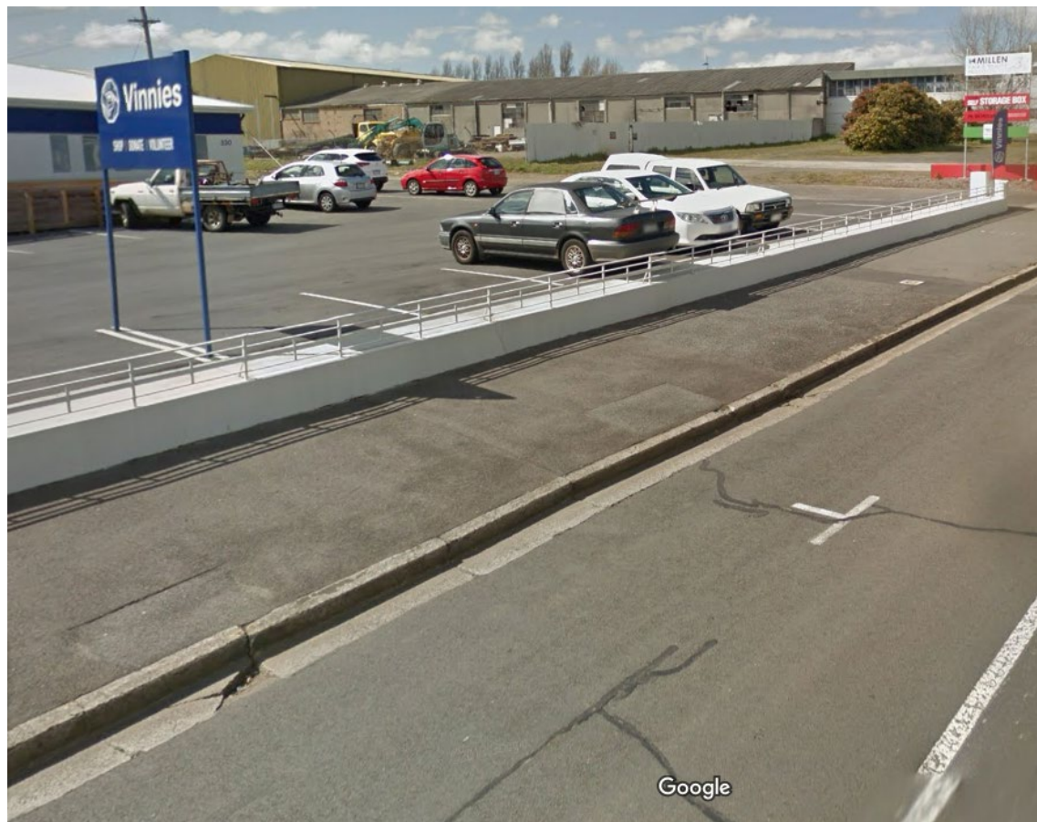
Image: Outside clinic showing car parking available

The clinic is operating from the Vinnies site (which is currently closed). There is parking at the site.