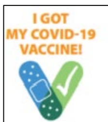
Image: Vaccination sticker